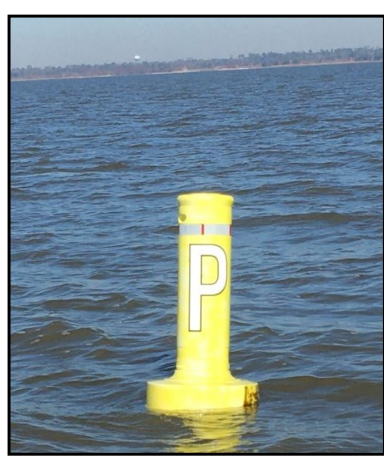
The brave new "P" mark. May she long remain on station